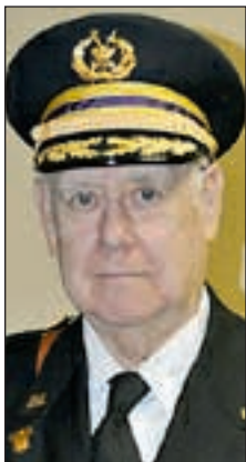
BRIG. GENERAL WILLIAM SNYDER

Full dress black coat, black slacks with a gold stripe running down the outside seam of the slacks, a sort-sleeved