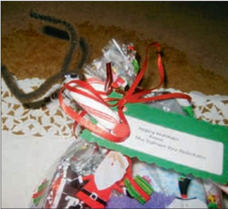
Here is one of Salmon Bay's care package with a candy cane reindeer.